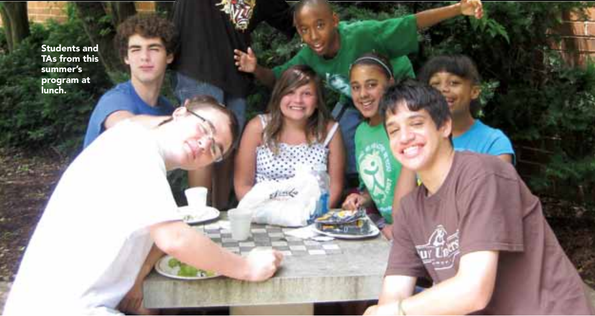
Students and TAs from this summer's program at lunch.